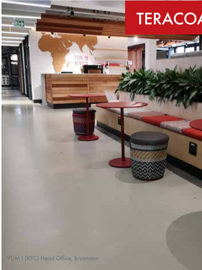
YUM ! (KFC) Head Office, Bryanston

Sustainability – Teracoat’s commercial floors are unparalleled when it comes to sustainability as they don’t have to be chopped out and dumped into landfills. Teracoat’s floors are water-based with very low VOC’s and have been installed on projects like Ernst & Young’s Waterfront Green Initiative Offices.